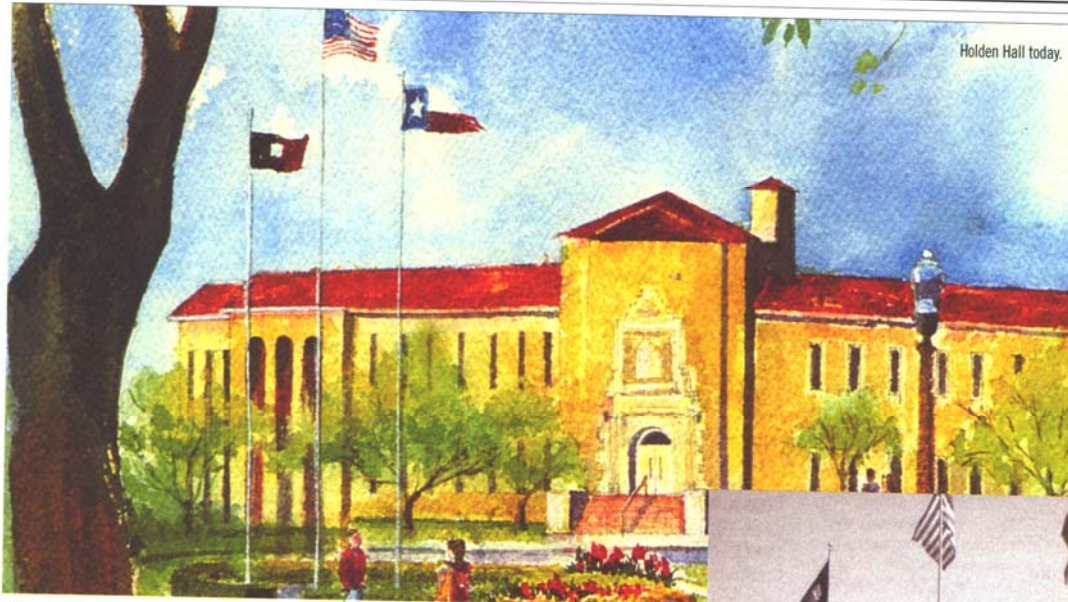
Holden Hall today.

Catalog, the following are included in the "Estimate of Annual Cost":