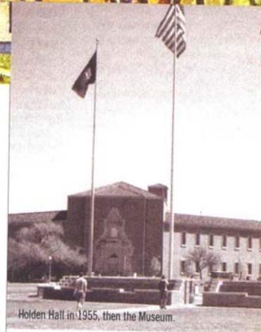
Holden Hall in 1955, then the Museum.

The college of then has grown into the university of now. The past 50 years have seen many changes for Texas Tech, but a continued commitment to higher education for the region was a component then and is now. The institution has grown into a research university, which continues to evolve. As I look back, I wonder what those involved with Texas Tech 50 years ago might have envisioned for the future. As I look forward, I wonder where Texas Tech will be 50 years from now. ■