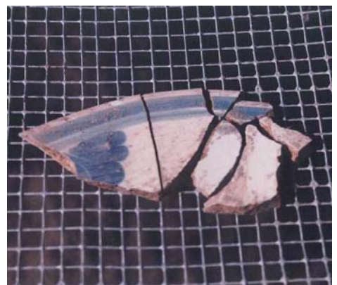
Shards from a plate found at the San Saba Presidio in Menard. The Texas Tech Archeological Field School began a dig at the presidio in June. They plan to return for further excavation over the next few summers.