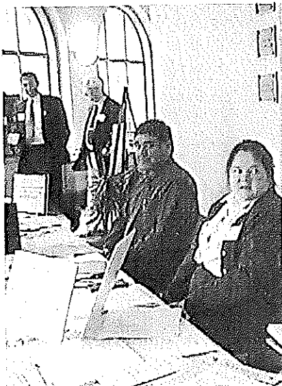
The Southwest Collection at Texas Tech University welcomes over 100 members to the 1999 WTHA meeting.